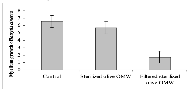
Figure 1. Effect of sterilized and filter sterilized olive oil mill wastewater (olive OMW) on mycelium growth of Botrytis cinerea .

The mycelia growth of B. cinerea significantly decreased ( p < 0.001 ) when filtered sterilized olive OMW was added on the agar surface where B. cinerea mycelium was growing (Fig. 1). In details, there was a statistical significant difference between filtered sterilized olive OMW and control (untreated PDA and sterilized with olive OMW PDA), ( P < 0.001 ). The total phenols content (0.4%), found on filtered sterilized olive OMW could be an explanation of olive OMW antimicrobial activity resulted the strongly inhibition of fungus mycelia growth.