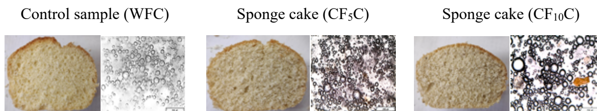
WFC – sponge cake containing 100% wheat flour; CF 5 C, sponge cake with blend containing 5% cricket flour and 95% wheat flour; CF 10 C- sponge cake with blend containing 10% cricket flour and 90% wheat flour.

The best evaluated in terms of appearance, cell size uniformity, crumb tenderness, odour and taste is the control sample (WFC) followed by 5% cricket-enriched cakes (Fig. 2). Sensory analysis showed that the colour of the outer surface of WFC, CF 5 C and CF 10 C after baking did not differ statistically significantly, but the cell size uniformity darkened with increasing % of CF replacement. These results are in sync with the colour lightness data ( L^* ) (Table 4).